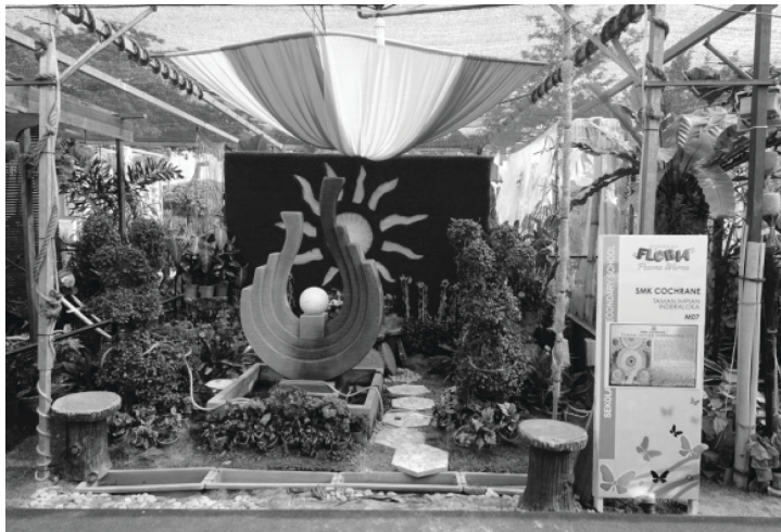
Photo 1: Shows an example of garden showcase by selected secondary and primary school