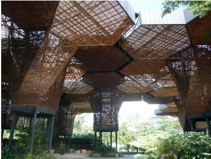
Figure 1. Orquideorama is designed to define perception as a situation where visitors can feel the extension of a forest (n.a., 2008)

influenced by the design of orchids. The organic approach is based on two different scales; (1) micro scale which holds the principles of material organization, defines geometrical patterns, (2) visual-external scale which allows to relate phenomenological and environmentally to the world. In this example, design approach is to reproduce a similar form of a bee hive and a forest but it stays just on a visual level.