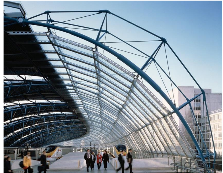
Figure 2. Waterloo International Terminal and glass panels mimicking a pangolin's outer shell (scale) (transformKC, n.d.)

In this level, solutions related to efficient energy usage and materials which are established already. In brief, it is mimicking an organism's physical attributes. An example at this level, based on mimicry of form and process is Waterloo International Terminal (See Figure 2) design by Nicolas Grimshaw & Partners. Considering its high span, the terminal need to respond to dramatic pressure changes as the train arrival and departure. Because of that glass panels are arranged like the scale of a pangolin, to adapt the imposed air pressure (Zari, 2007). Replicating an organism level is related to specific features to solve a certain specific problem thus biomimicry is not integral idea of a design and design may remain conventional. The design may result with a new, fancy looking building but ecological outcome is not necessary at this level.