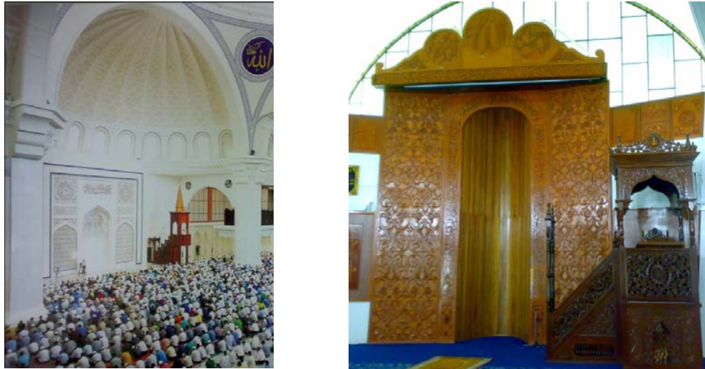
Figure 2: Interiors of Wilayah (Left) and Negri Sembilan (Right) Mosques for supporting religious and social activities

Consequently, religious and social activities could be considered as the significant factors in leveraging people's attachment to mosques. Results of the conducted questionnaire survey showed a significant but low correlation between the participants' activities and their place attachment (Najafi & Sharif, 2011c). However, as the studied mosques were located at non-residential areas, despite organising various religious and social activities there, only praying made a significant impact on people's place attachment. In other words, the studied mosques are used for their basic function as a place of worship. This finding is aligned with Tajuddin's (1998) idea that due to the commercial location of the state mosques, only the people who work in that vicinity are the general attendees of daily and weekly prayers there; and the other types of social and religious activities are rather weak within these contexts. The state mosques therefore are meant to be Islamic symbols at a national level and act as dominant structures in their contextual settings rather than merely affording religious and social activities. They gradually became recognised landmarks that could be recognised even from miles away to fortify Islamic identity of the area, hence serving as symbols