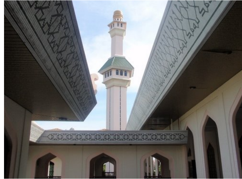
Figure 1: Dome of Putra Mosque (Left) and Minaret of Al-Azim Mosque (Right) as two remarkable symbolic elements