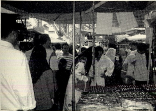
Figure. 3.0 Variety of goods and choices of products sold by the vendors in JMI.

Diversity has been influential in encouraging attachment and attraction to the shopping streets. It is associated with the variety of goods and specialties pertinent to the needs of the streets' users. Their needs are fulfilled because they can get almost everything that is needed for their daily lives and appropriate to their way of life and culture. For instance, JMI-TAR offers Malay, Indian Muslim and Indian traditional costumes such as baju kurung , baju Melayu and saris which are highly in demand particularly during festive seasons.