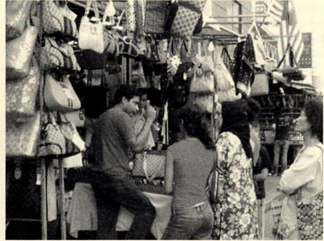
Figure. 4.0 Variety of products characterizes the image of JP

Diversity has been influential in encouraging attachment and attraction to the shopping streets. It is associated with the variety of goods and specialties pertinent to the needs of the streets' users. Their needs are fulfilled because they can get almost everything that is needed for their daily lives and appropriate to their way of life and culture. For instance, JMI-TAR offers Malay, Indian Muslim and Indian traditional costumes such as baju kurung , baju Melayu and saris which are highly in demand particularly during festive seasons.