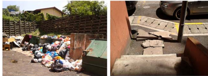
Figure 3: Lack of maintenance on the pavement and refuse area

The survey revealed that different studied elements as liveability indicators for evaluation on the liveability of communities in study site are less unity and inconsistent in performance due to the perception of the residents. Respondents most commonly noted community recreational facilities as the most important elements of a livable community. Various liveability indicators for the quality of community recreational facilities should be taken into account during survey.