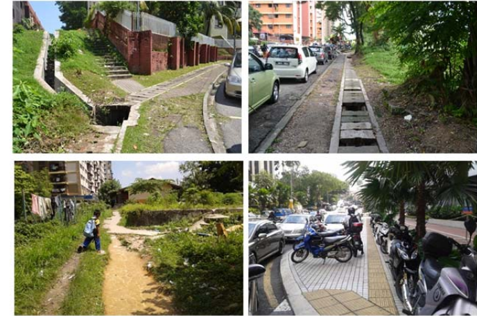
Figure 4: Poor condition of pedestrian paths in Bangsar Utama

However, the provision of community recreational facilities in both flats are insufficient to cater for the size of population therefore it is failed to enhance liveability of the communities in study site. Hence the survey on the importance level of community recreational facilities as rated by the residents can be act as reference while addressing issues of shortcoming on it. In addition, the findings from the survey on existing pedestrian paths reflected that it is pedestrian unfriendly due to its poor connectivity and failed to encourage people to walk to their destination (Figure 4). Existing pedestrian paths are one of the common barrier for implementing livable communities and health promoting activities since the path's condition made the walking environment more uncomfortable and treacherous over time. Overall conditions of pedestrian paths are needed to be improved to create pleasing and safe sidewalks for the residents.