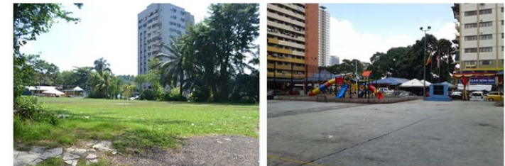
Figure 5: Lack of green open spaces and abandoned green open spaces in Bangsar Utama

Green open spaces are also insufficient (Figure 5) to cater for resident's need in participating outdoor recreational activities for promoting healthy lifestyle. Similarly for existing pedestrian paths, it's shortcomings are need to be take into account to achieve the desired level of liveability as perceived by the residents. Elements which are important in improving the existing condition of green open spaces can be carried out in accordance with resident's needs and expectation.