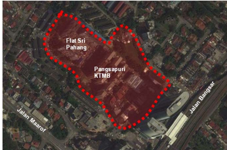
Figure 2: Study site- Flat Sri Pahang and Pangsapuri KTMB. (Adapted from: http://maps.google.com.my )

Data collection was carried out through two procedures. Firstly, the land use zoning and the location of public spaces with facilities, green open spaces, pedestrian and bicycle paths, public transportation and local basic services (school and health) were identified in mapping study. The linkages and distance between housing to that studied common spaces were also carried out in the mapping study. Existing condition and other findings on studied elements in research site are needed to be observed and record.