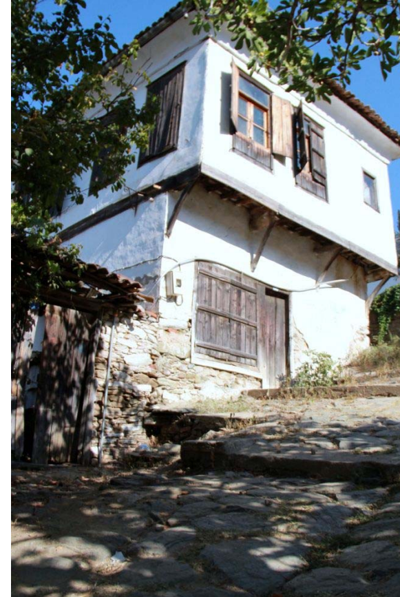
Figure 16: Construction Technique: Rubble Stone Masonry on the Ground Floor and Timber Frame on the Upper Floor (Photograph by author, 2012)

stone masonry, and covered with lime plaster and white wash, and then continued with timber frame structure for the upper floors of the houses (Figure 16). Some of the houses have wooden orioles. The filling of this frame is consisted of mostly rubble stone. The interior walls are usually timber frame structure with lime plaster on wood lath.