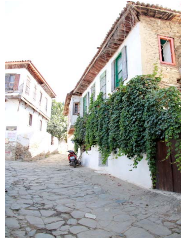
Figure 18: The Garden Wall Covered with Vegetation

The garden walls aren't high and they are made of rubble stone with plaster or without plaster, and are covered organically with vegetation (Figure 18). Lime mortar is used as binding material in the stone walls.