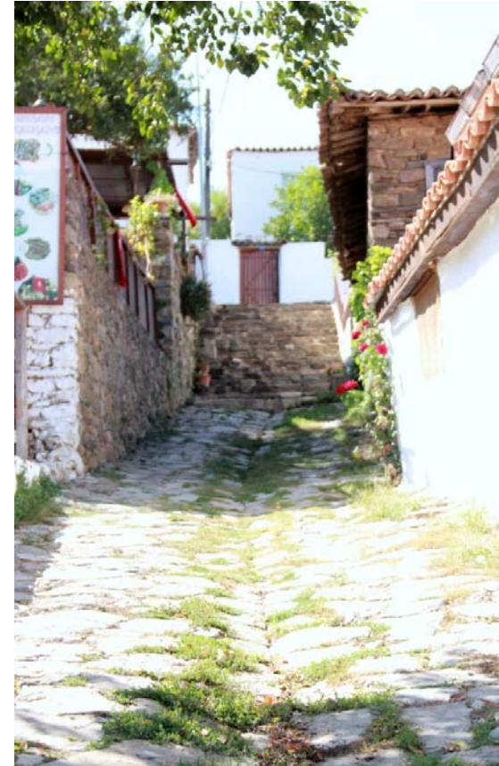
Figure 7. The Street Made of Rubble Stone and Built with Stairs in order to Reduce the Pitch (Photograph by author, 2012)