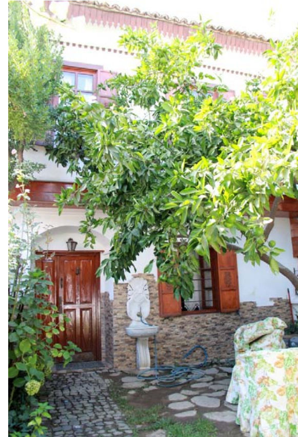
Figure 14: A View of Front Garden