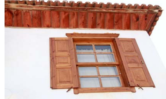
Figure 20. The Shutter Made of Wood (Photograph by author, 2012)

In these houses traditional external shutters are used (Figure 20). The shutters of windows are formed of two vertical timber planks attached to three horizontal planks. On two sides of the windows on wall surface there are metal elements that are twisted over the shutters to keep them open.