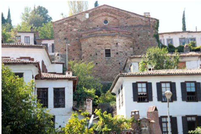
Figure 4: St. John the Baptist Church

Topography consisting of steep slopes affects the location of the houses and the form of the streets in this settlement. The houses are located on the two sides of the valley (Figure 5). The streets are narrow, sloping, and sinuous