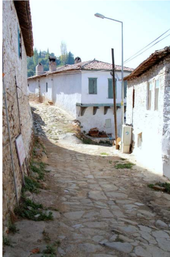
Figure 6. A View of a Typical Narrow, Sloping, and Sinuous Street (Photograph by author, 2012)