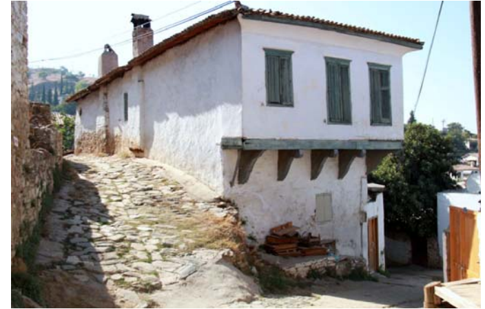
Figure 10: Different View of Façades due to Topography

One side of some houses is near the upstream slope or embedded and their other side looks to downstream slope. Thus, the front façades facing the view are two storeys, whereas the back façades are single storey (Figure 10). However, the houses are built respectful to each other. They are oriented without blocking each other view, sun and wind.