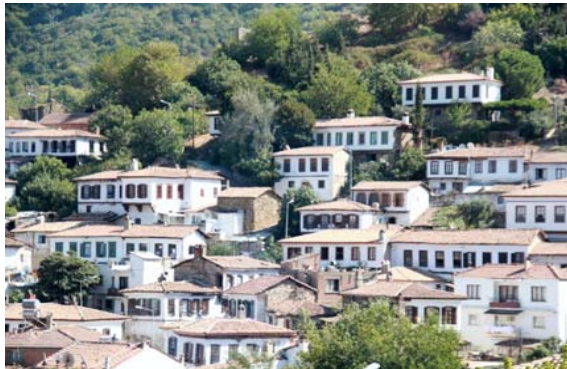
Figure 9: Contiguous Houses

One side of some houses is near the upstream slope or embedded and their other side looks to downstream slope. Thus, the front façades facing the view are two storeys, whereas the back façades are single storey (Figure 10). However, the houses are built respectful to each other. They are oriented without blocking each other view, sun and wind.