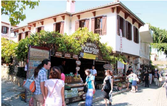
Figure 3: Traditional Commercial Area in Şirince Village