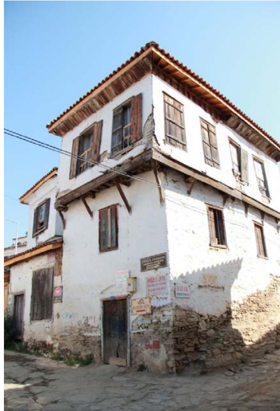
Figure 19. Modular and Wooden Windows (Photograph by author, 2012)

In these houses traditional external shutters are used (Figure 20). The shutters of windows are formed of two vertical timber planks attached to three horizontal planks. On two sides of the windows on wall surface there are metal elements that are twisted over the shutters to keep them open.