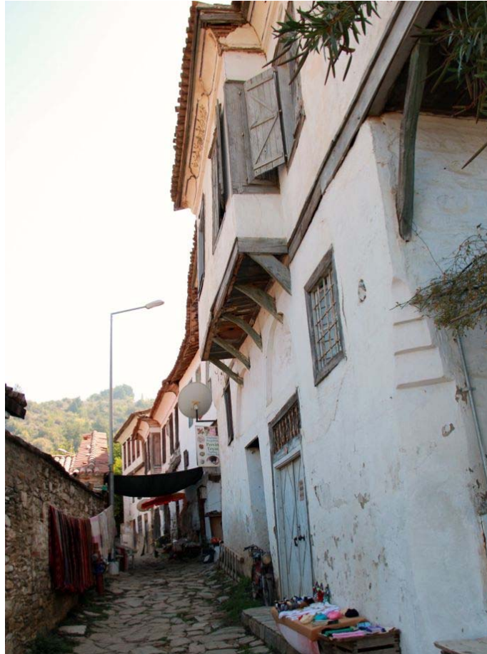
Figure 11: A View of Two-Storeyed Houses

Some of these houses have open spaces mostly like front garden are enclosed by walls which from the street (Figure 12). However, some of them are entered directly from the street (Figure 13). These gardens are mostly located between the street and the main façade of the house and the house is usually entered from these front gardens (Figure 14).