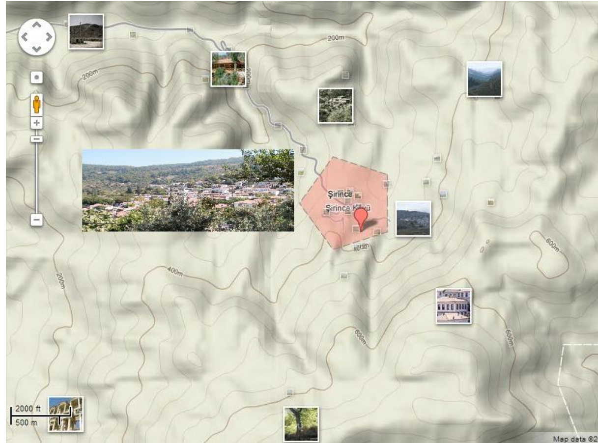
Figure 2: Location of Şirince Village

There is one road in order to access to the village. This road makes a loop in the eastern village square. This also is the main vehicular axis within the village. The main pedestrian axis starts at the eastern village square, continues the western square which is used as a traditional commercial area (Figure 3) in the middle of the settlement and reaches to St. John the Baptist