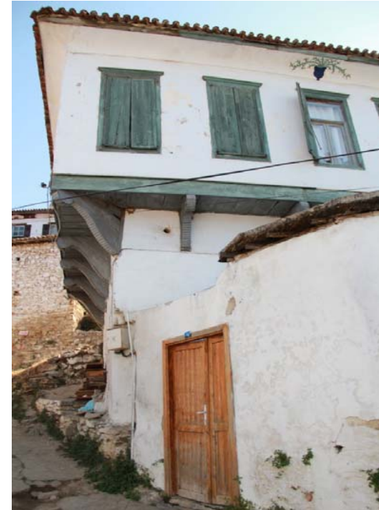
Figure 12: Entrance from the Garden Enclosed by a Wall which from the Street

Some of these houses have open spaces mostly like front garden are enclosed by walls which from the street (Figure 12). However, some of them are entered directly from the street (Figure 13). These gardens are mostly located between the street and the main façade of the house and the house is usually entered from these front gardens (Figure 14).