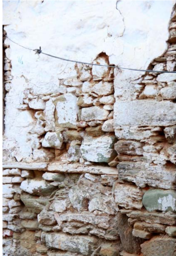
Figure 15. Rubble Stone Wall

interior partition walls, on beams and veneering of floor, at all kinds of door and window furniture and all the roof elements in almost all houses. Lime which has a limited usage field in the houses is mostly used as plaster and mortar material.