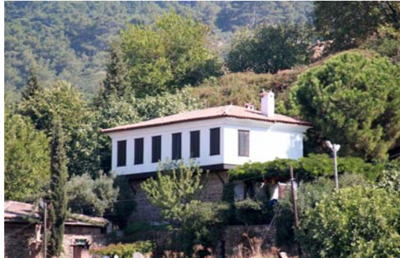
Figure 8: Detached House (Photograph by author, 2012)