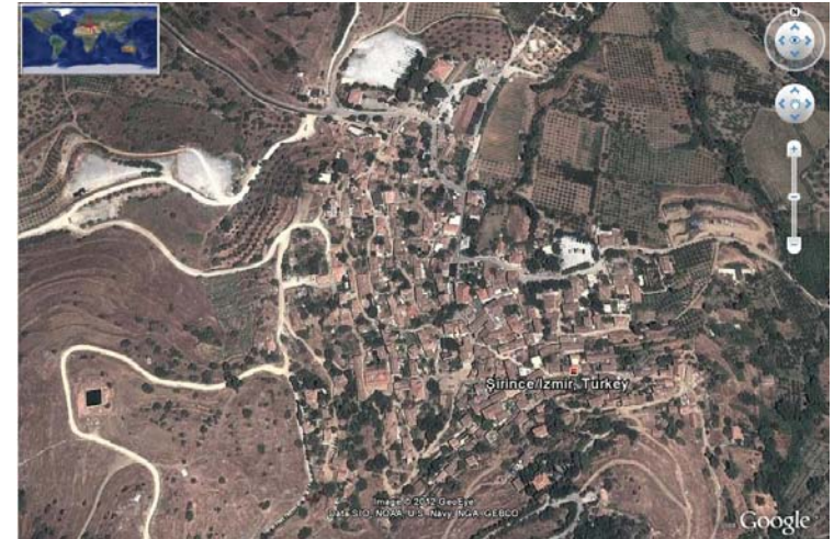
Figure 1. Overview of Şirince Village (Edited from Google Maps, 2012)

Şirince (meaning pleasant in Turkish) is a small vernacular settlement in the Aegean region of Turkey, and one of the 8 villages of Selçuk District of İzmir Province (Figure 1). It is an inland, hillside village, and surrounded by agricultural lands. Şirince is located at the south and east sides of a valley approximately 375 m high from the sea level. There are hills on the south and east boundaries of the settlement. On the north side there is a plain, and on the west side there is a second valley. Also, there is a riverbed that runs south to north as a natural boundary that divides the settlement into two neighborhoods. Agricultural fields such as vineyards and fruit gardens are mostly located outside the settlement on the flat areas of the plain. The settlement is located in first degree earthquake zone of Turkey. Also, it has in a significant location in terms of tourism because of the fact that there are archaeological sites including Ephesos, Miletos, Priene, House of Holy Virgin Mary, and other tourist centres like Kuşadası and Selçuk and beaches like Pamucak Beach in its vicinity.