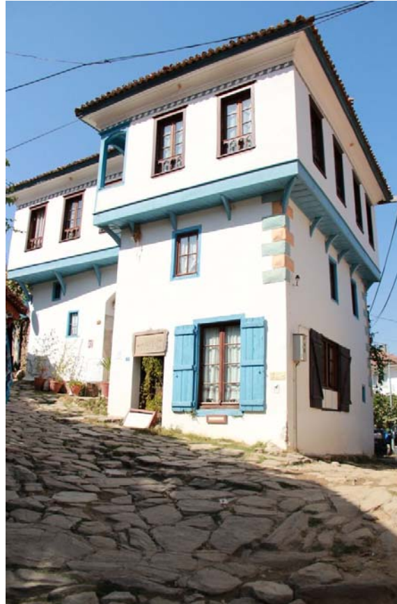
Figure 13: Entrance Directly from the Street