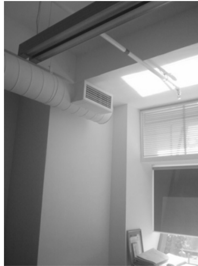
Figure 4: In the enclosed office, the duct outlet provides non-uniform air distribution