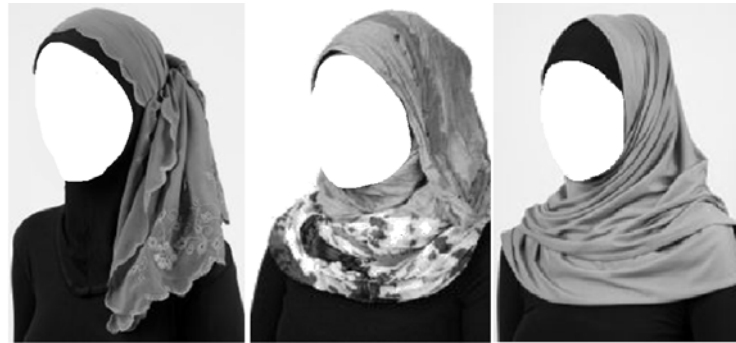
Figure 1: Types of head covering in females in the building (at the right, the two-piece scarf covered the neck, at the middle, the one-piece scarf used to cover the head, and upper part of the chest, at the left, the two-piece scarf covers the head and the upper part of the chest)

investigated head covering affect in different environment (chambers, hospitals, and farms) and subjects (infants, patients, and harvesters).