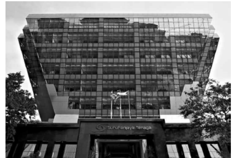
Figure 2: Diamond Building in Putrajaya, Malaysia

The method used in the present study was online questionnaire and included the head covering in the questionnaire. The objective was to investigate the effects of head covering on thermal comfort in radiant cooling environment and the relationship with the personal variables, expectations, preferences, and sweating. The subjects themselves choose their garment from the online clothing list. The data then analysed using SPSS program.