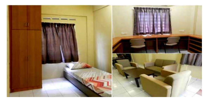
Figure 2: Accommodation in UPM (Upm Holding, 2015)

did not feel attached to UPM campus. Table 3 shows the result of level of attachment of UPM campus.