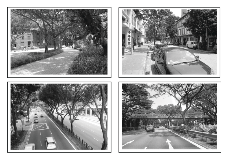
Figure 1.1: Singapore city-wide revitalisation (streetscape improvements by sidewalk widening, floorscaping and recycling of existing building stock (above) and beautification along transport major corridors (below).

effort of greening the city and implementing tree planting programs along main road corridors and the creation of small parks has labelled Singapore as the Garden City (Ker 1997, Newman and Thornley 2005). Examples of different types of city-wide revitalisation projects are shown in Figure 1.1.