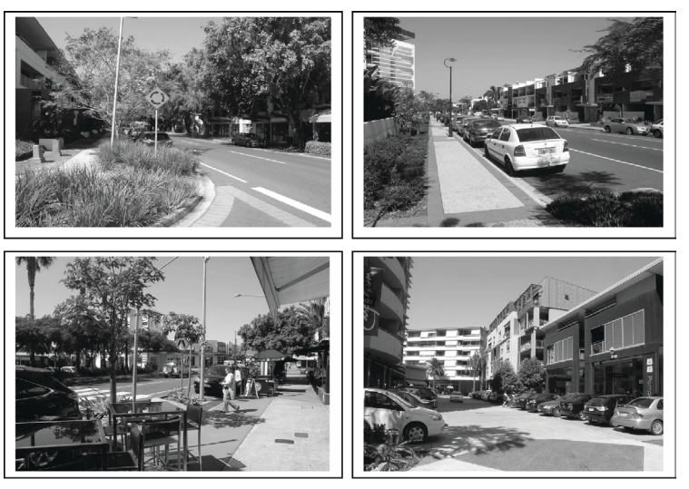
Figure 1.3: Revitalisation with URTF intervention (street improvements in Teneriffe (top); James Street Market and Emporium developments (below).

However, the intervention of URTF in the Brisbane's inner city suburbs has contributed to the gentrification of the urban environment, and a rapid increase of property prices. This had totally changed the social profile of the Brisbane inner city area (Kozlowski and Houston 2008). Figure 1.3 shows examples of projects coordinated by the Urban Renewal Task Force.